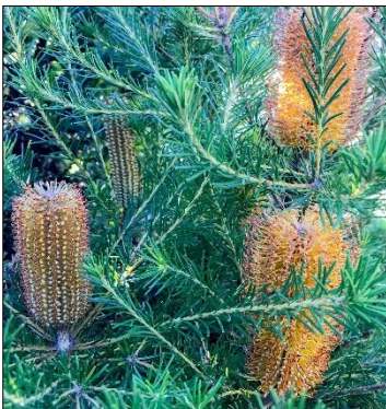
Banksia ‘Birdsong’ in Bruce Cadoret’s garden flowering now

Still a few things to do in the garden including weeding, trimming, dead heading flowers, and also including planting a few small plants in the little gaps that remain. Sometimes just walking around the garden is enjoyable, especially when you see plants self-sowing, and of course beginning to flower. Plants flowering now include: Alyogyne huegelii , Brachyscombe dentata/mulifida , Banksia ‘Birdsong’ , Banksia ericifolia , Banksia ‘Giant Candles’ , Banksia praemorsa , Correa glabra , Grevillea sp. , Pelargonium australe , Scaevola sp. , Xerochrysum bracteatum , Xerochrysum viscosum , and the first flowering wattle Acacia beckleri (Barrier Range Wattle) in the garden for the year ( photo: P. 3 ).